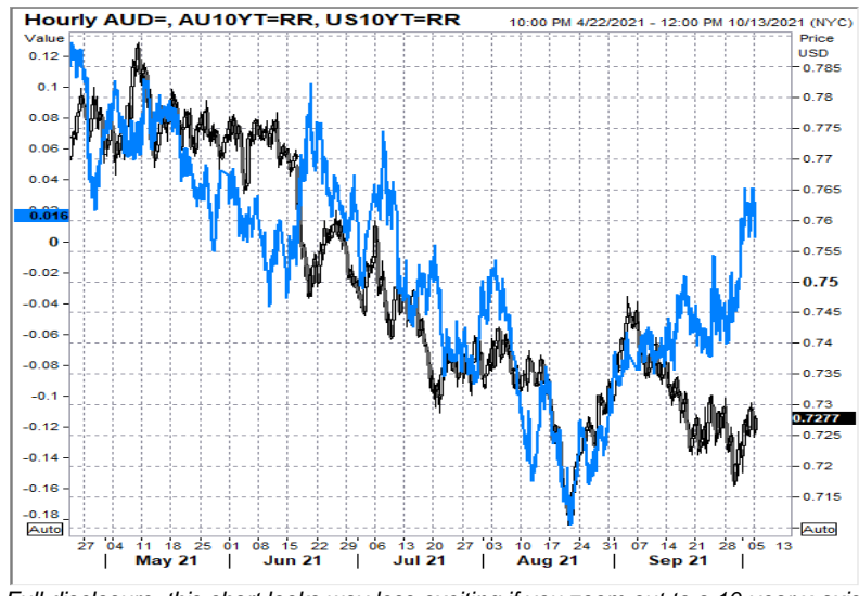
Full disclosure, this chart looks way less exciting if you zoom out to a 10-year x-axis. For trading, changes are always more important than levels.

Meanwhile, <u>China is quietly releasing Australian coal</u> despite prior aggro. And the negative seasonality in risky assets is almost done (October 9 is historical seasonality bottom day for SPX).