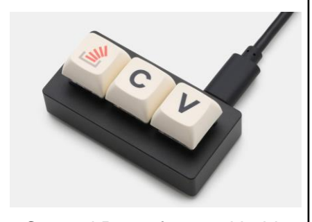
Cut and Paste faster with this tiny macropad!

bdonnelly@spectramarkets.com (212) 398-6230