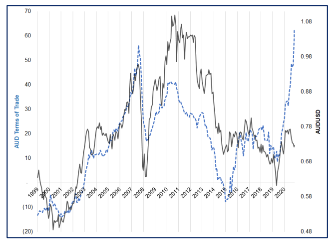
Ticker CTOTAUD