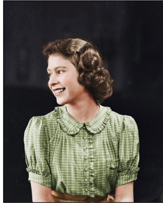
Princess Elizabeth, before she was queen

The Platinum Jubilee is a celebration to mark the 70 th anniversary of a monarchy. Today is Queen Elizabeth II's Platinum Jubilee.