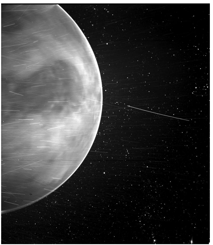
Venus from 12000 miles out