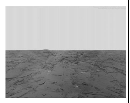
The surface of Venus

bdonnelly@spectramarkets.com (212) 398-6230